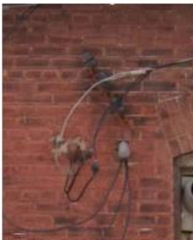
KCGW piece in middle of bracket, still in service.